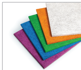
Paintable, with a wide range of colors.