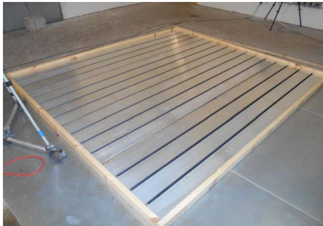
C25 test with 1-inch backing)

Laboratory Equipment & Procedures available upon request