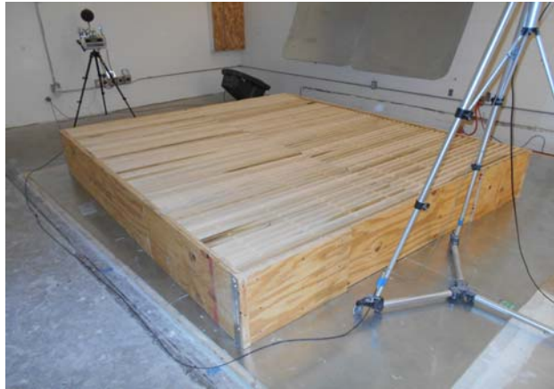
E400 test with Grille (2" backing)

Surface area: 6.69 m 2 Room volume: 234.4 m 3