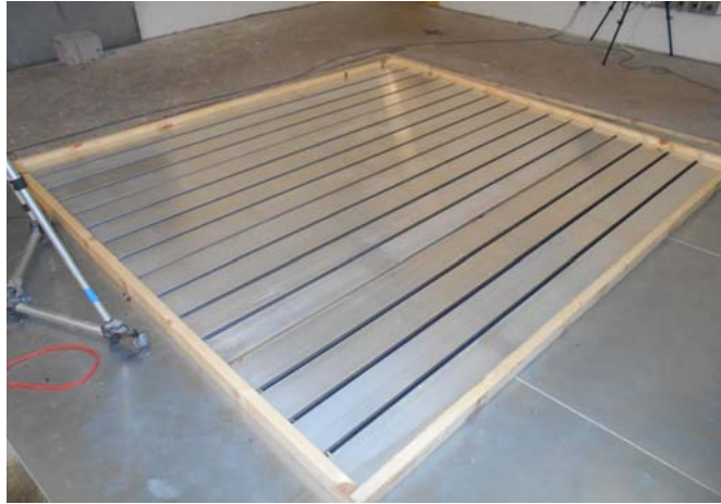
C25 test with 1-inch backing)

Laboratory Equipment & Procedures available upon request