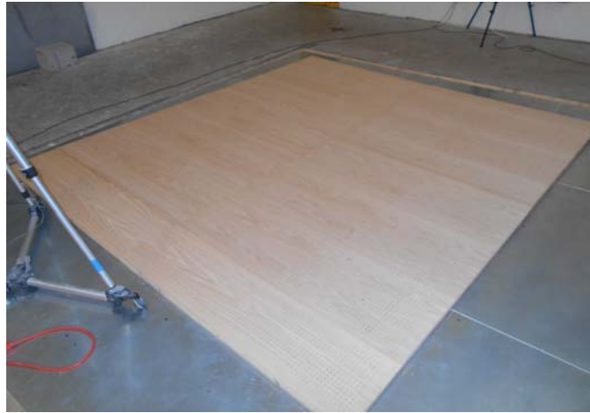
C25 test with 1-inch backing

Laboratory Equipment & Procedures available upon request