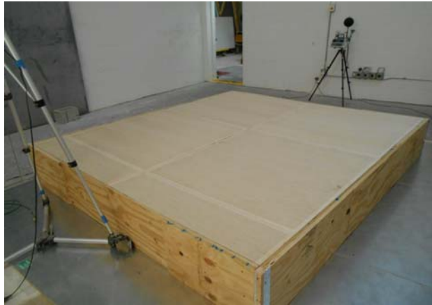
E400 test with Audition 8 (2" backing)

Surface area: 6.69 m 2 Room volume: 234.4 m 3