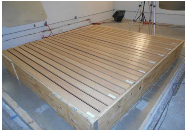
E400 test with 6" Linear Reveal (2-inch backing)

Surface area: 6.69 m 2 Room volume: 234.4 m 3