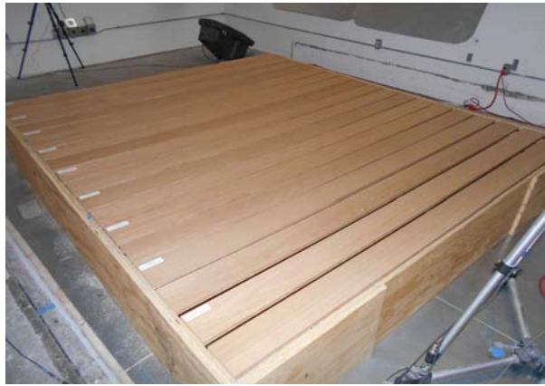
E400 test with 6" Linear Veneer (1-inch backing)

Surface area: 6.69 m 2 Room volume: 234.4 m 3