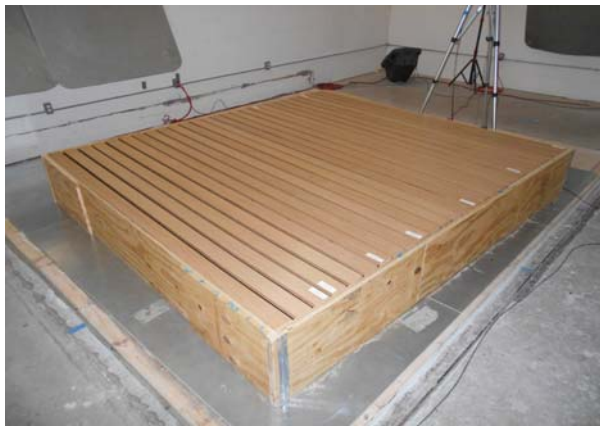
E400 test with 4" Linear Veneer (1-inch backing)

Surface area: 6.69 m 2 Room volume: 234.4 m 3