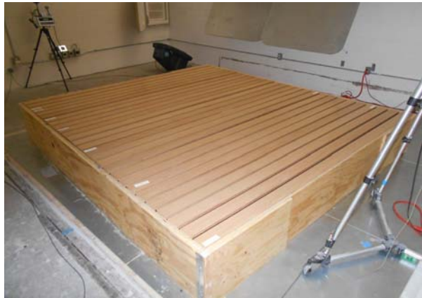
E400 test with 4-1/2" Linear Veneer (1-inch backing)

Surface area: 6.69 m 2 Room volume: 234.4 m 3