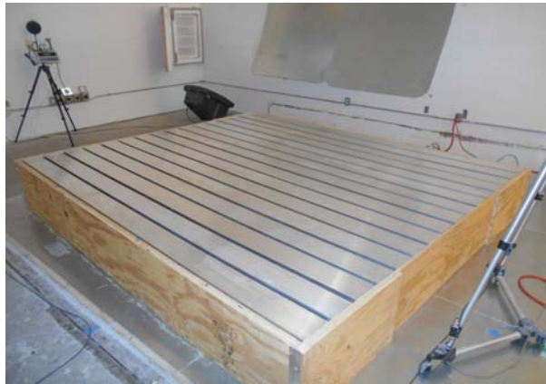
E400 test with 6" Alumiline (2-inch backing)

Surface area: 6.69 m 2 Room volume: 234.4 m 3