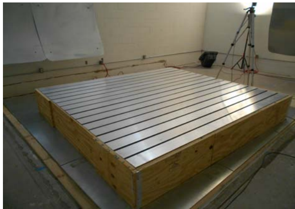
E400 test with 6" Alumiline (1-inch backing)

Surface area: 6.69 m 2 Room volume: 234.4 m 3