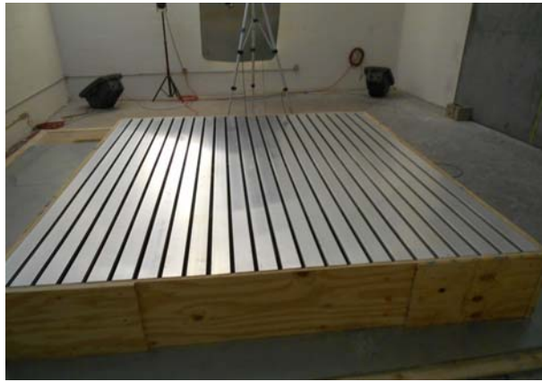
E400 test with 4" Alumiline (1-inch backing)

Surface area: 6.69 m 2 Room volume: 234.4 m 3