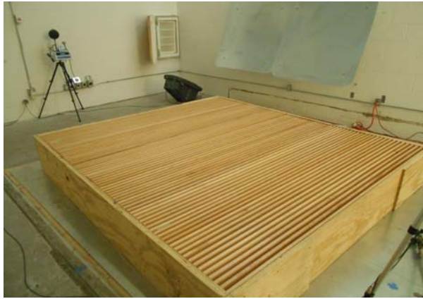
E400 test with Grolle Backered (2-inch backing)

Surface area: 6.69 m 2 Room volume: 234.4 m 3