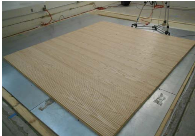
C25 test with 1-inch backing

Laboratory Equipment & Procedures available upon request